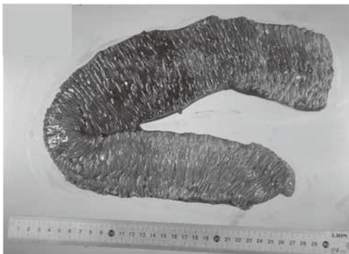
Fig. 2 Resected specimen showing segmental intramural hematoma localized to a part of the jejunum with intact mucosa.

Dilation of the small bowel proximal to the thickening was also recognized, suggestive of a small bowel obstruction.